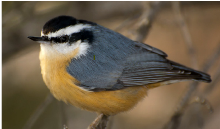
Alberta Institute for Wildlife Conservation

These little birds love the trunk of a tree, they look for insects in the bark. It has three front toes and