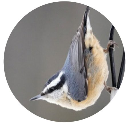
An Upside Down bird

one large back toe, allowing it to go up, down or sideways on the bark. Their nickname is the 'upside down bird', and they do appear to have little regard for gravity. In the winter they switch from insects to seeds. They are also happy to eat food from a bird feeder and are a common visitor to look for. Who doesn't love a free lunch!