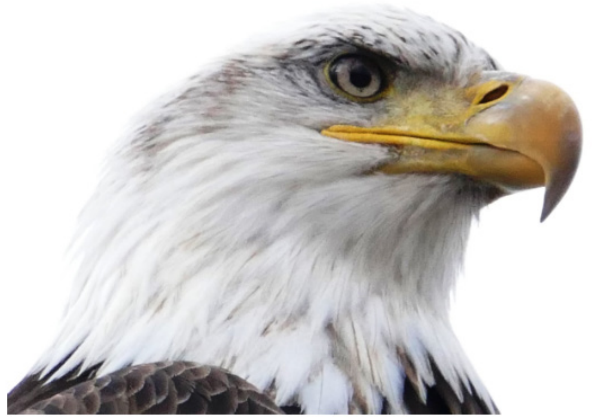
taken at Stanley Park

The most dramatic behaviour of a Bald Eagle I have seen is when I was swimming in the Pacific Ocean one year. An eagle swooped down and snatched a gull who was casually paddling near me. I know for that poor gull, whose last look at earth included a fast receding woman in the ocean, mouth agape,