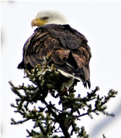
taken in Weaslehead

When I do an internet search on a Bald Eagle I can see what other popular searches come up. As with other birds, there is one that says 'what does it mean when I see a Bald Eagle'. Before I started writing articles I wasn't aware that people looked at birds as little omens as they went about their day.