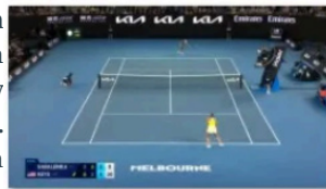
✔ Australian Open

In typical tennis fashion, some players debated it, others shrugged, and a few laughed, but all agreed the ball remains easy to see, which is ultimately what matters.