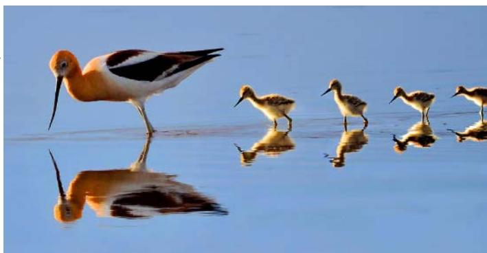
Great Sand Dunes National Park and Preserve

Finn and I walked back along the road, collecting what appeared to be auto parts along the way. Either they fell off a truck or the city trucks are actively