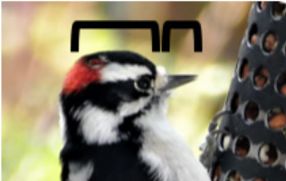
Downy Woodpecker: the beak is half the size of the head.

Follow-up: After I wrote my article on Downy vs. Hairy Woodpeckers I saw a great article about them on the Cornell Ornithology website. The best way to tell them apart is to look at the relative size of their beak compared to their head. This way you don't have to create an imaginary bird beside them! All the information is right in front of you.