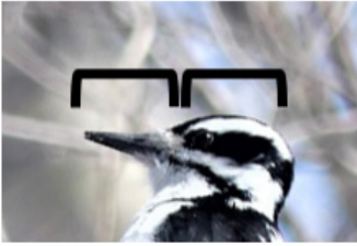
Hairy Woodpecker: the beak is the same size as the head.