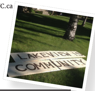
Lakeview News & Views

Show us your Lakeview. Tag your Lakeview Instagram photos with the hashtag #LakeviewYYC. We would love to see your photos and use them here in the newsletter.