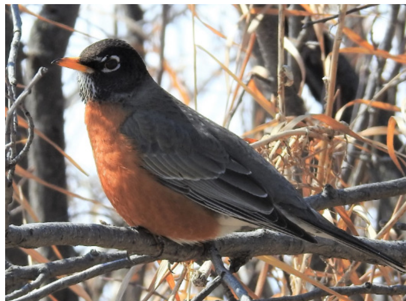
Adult American Robin in North Glenmore park

The Robin in the U.K. and Europe are not part of the Thrush family. They aren't related to the North American Robin at all. These Robins are super cute and look like a little reddish puff ball on long legs. Don't look them up, they make our